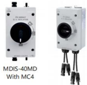
MDIS-40MD With MC4