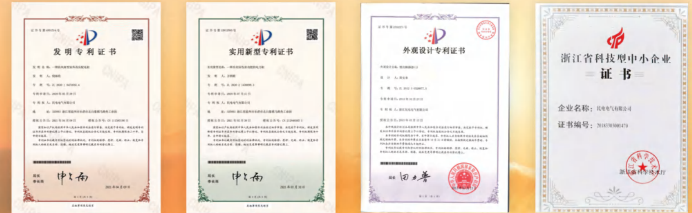
PATENT FOR INVENTION