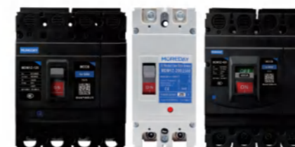
MDM1Z-125 MDM1Z-250 MDM5Z-400