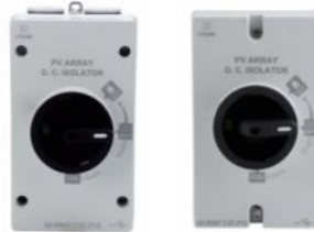
With Breathing Valve